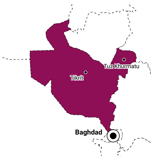
Figure 3: Map of Salahadin District

Tuz Khurmatu, a commercial centre and transport hub in the northeast of Salahadin, has witnessed more violence than any other area of the disputed territories, most recently between the Kurdish and Shi'a Turkmen communities. Tensions initially arose in the years following the fall of the regime in 2003 due to the political dominance of the Kurds, who took advantage of US backing and occupied the buildings of the former Iraqi regime. They held the office of the mayor and other key positions, and sought to administratively align the city with Kirkuk over and above Tikrit. Ultimately, they filled the political and governmental vacuum in the district,