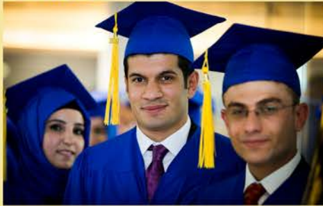
Four out of five of our students receive financial aid.

The University accepts all qualified students regardless of economic, ethnic or religious background.